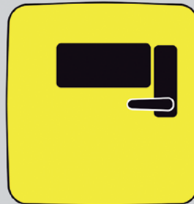
Ce-Tek Medical 4000 Ile

Battery powered, motion sensor LED light to illuminate cabinet on opening. Easily detachable for use as a torch in a rescue