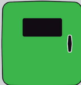
Ce-Tek Medical 4000 ile

Internal AED hook on back wall accommodates any defibrillator ensuring AED is elevated from base and clearly visible through large viewing window.