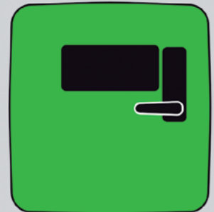
Ce-Tek Medical 4000 Ile